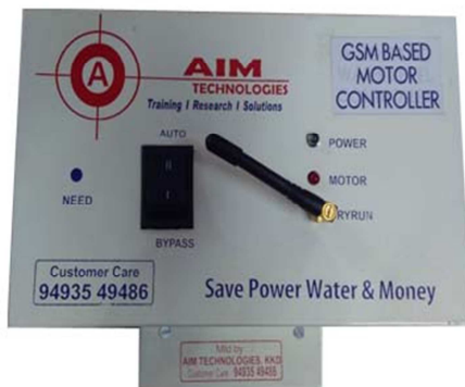
GSM Based Motor Pump Controller