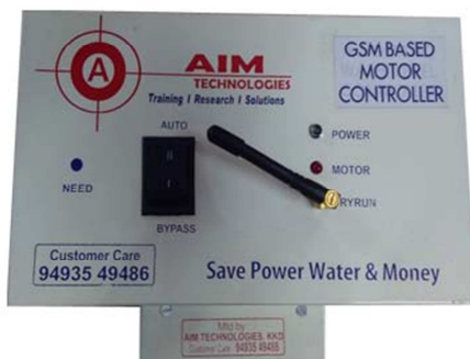
GSM Based Motor Pump Controller