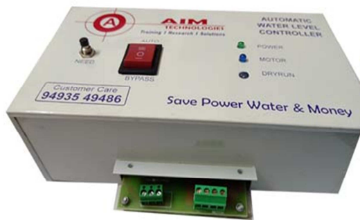
Water Level Controller Fully Automatic