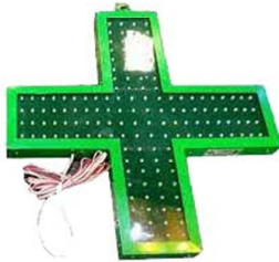
LED Medical + Flasher