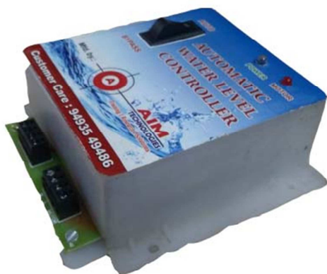
Water Level Controller (Semi Automatic)